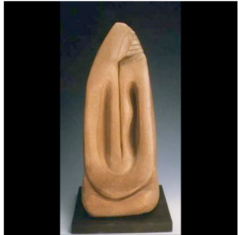
Susan O'Hara COUPLE 14" x 6" x 5" Wood Fired Terra Cotta Sculpture